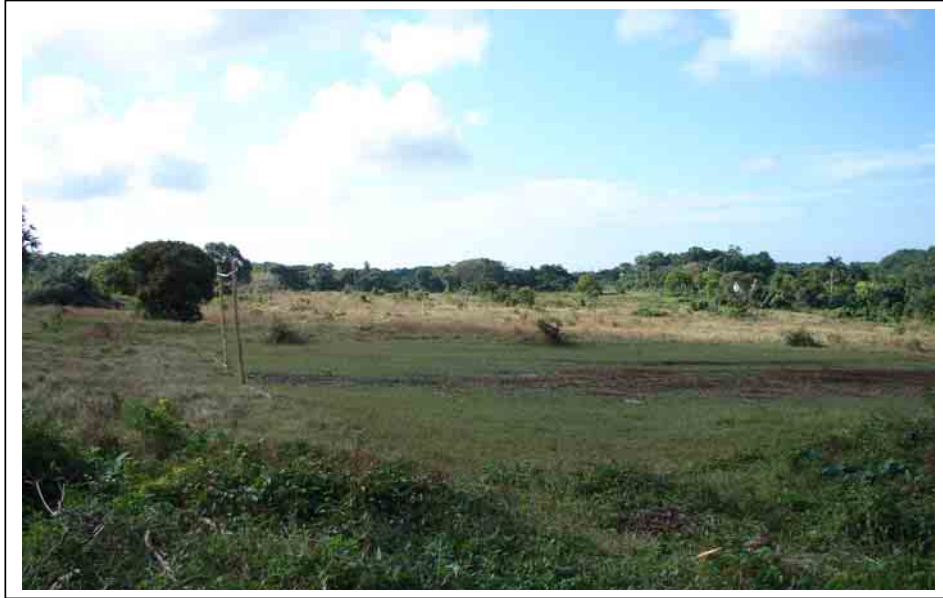
Plate 5.4.11: Existing Football Field

Recreational facilities provided by GMBA can also supplement the recreational facilities on site. These include beaches, clubs, parks, and amusement centers.