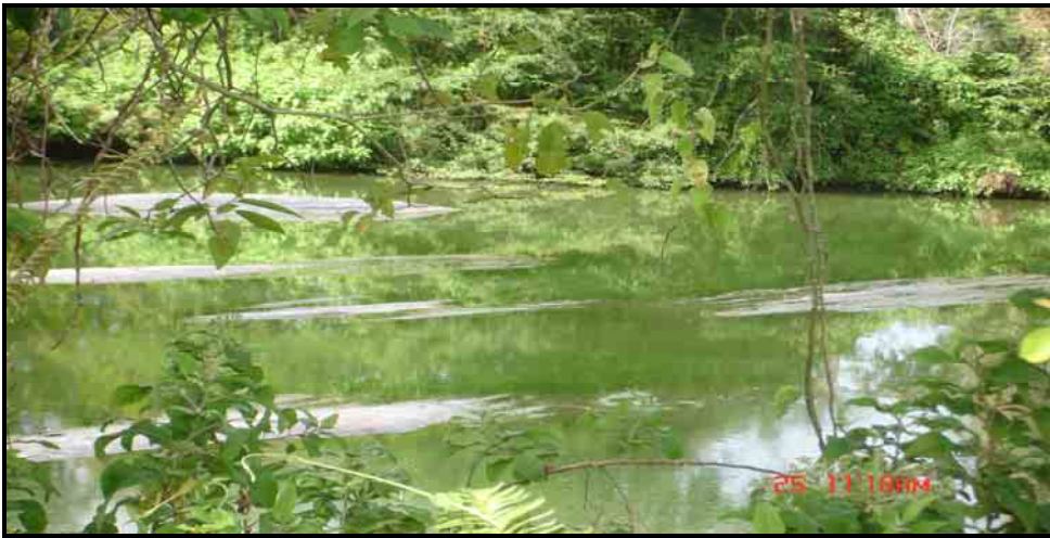
Plate 5.4.5.2 b: Raw sewage pond with lining at the surface

The raw sewage pond consists of two submerged chambers made of earthen material and is lined (Desmond Flowers Pers. Com.). Evidence of the lining was seen on the surface, as seen in Plate 5.4.5.2 b, this indicates a possible breach of the lining. Treatment of the sewage is by settling and natural aeration, and the effluent is currently discharged into a stream that ultimately enters the Boyce Gully. In order to facilitate the proposed Rhyne Park Village the pond will require draining, excavation and filling. The area will be incorporated into areas used for housing solutions.