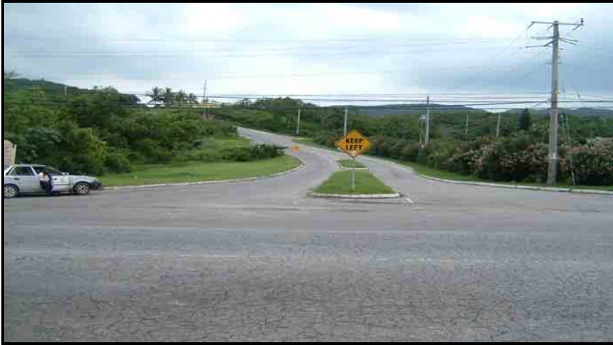
Plate 5.4.6 a: Access road to the project site, off the Rose Hall main road (view from the main entrance of Wyndham Rose Hall)

Wyndham Rose Hall main entrance. Currently the site is accessed via the Rose Hall main road (Plate 5.4.6a) and the existing entrance to the VMBS houses. (Plate 5.4.6a)