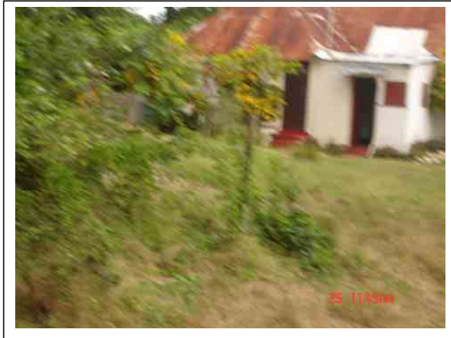
Plate 5.4.3: House in which the former caretaker of the property lived, now occupied by his family