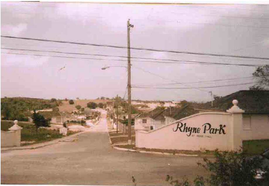
Plate 5.4.6.b: Existing entrance to VMBS houses