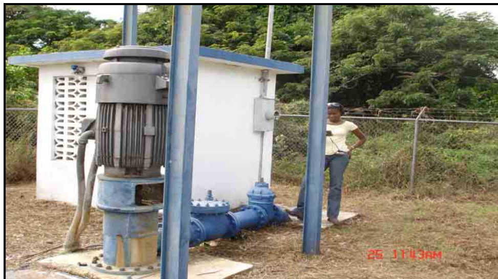
Plate 5.4.5: Existing NWC pump house.

planned and started in 1994. These will all be removed and new infrastructure put in. Only the NWC pump house as shown in Plate 5.4.5 and the Survey Department Trigonometric Station will remain.