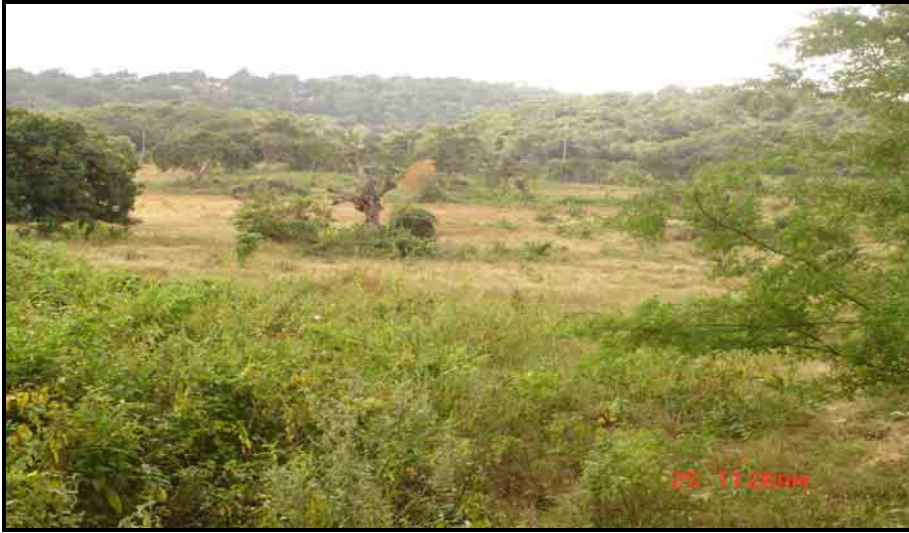
Plate 5.4.4: Trees and shrubs to the south of the property.

There is very little evidence of agricultural use on the existing property. However, the back yard of the former caretaker's house on the property has a small area for the cultivation of domestic crops.