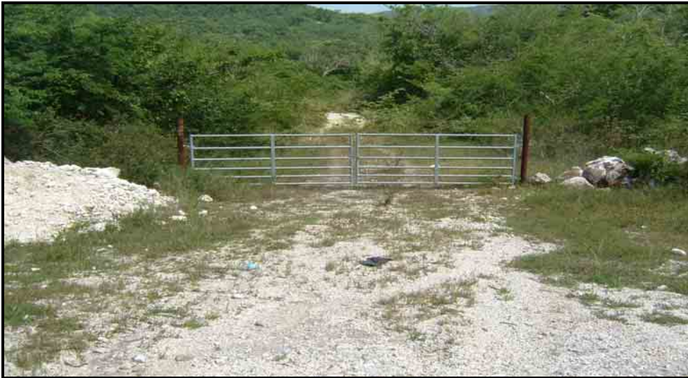
Plate 5.4.6 c: Western entrance to the property to be upgraded with a road and a new bridge

A traffic study (Nicholson, 2006 in Appendix XIII) was conducted to determine the impact the development could have on current and future operations of relevant roads in the area. The p.m. peak hour (5:00- 6:00 p.m.) is typically considered to be the critical hour in intersection performance analysis for this type of development and therefore be the period used for calculations. A 10-year growth rate of 3% per year was considered for analysis of the traffic demand on the roads. The Level of Service (LOS) is used to evaluate the conditions of the roads (Appendix XIII). LOS A is considered to be the highest level of service and LOS F to be the lowest.