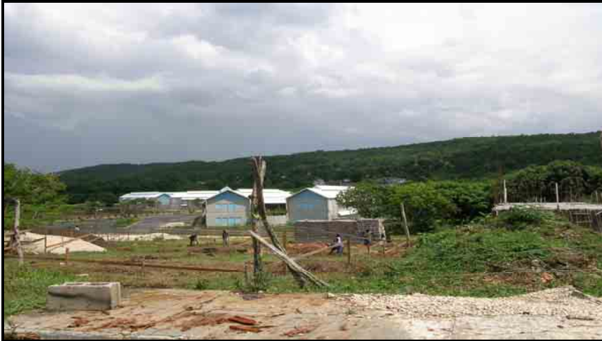
Plate 5.4.8: Spot Valley High School

Several educational institutions are located in nearby communities. These include Spot Valley Basic School, Barrett Town All Age School, Success Primary and Spot Valley High School (Plate 5.4.8). The Herbert Morrison Secondary School, the Montego Bay Community College, Cornwall College and Mt. Alvernia High School for girls, are also located in the Parish.