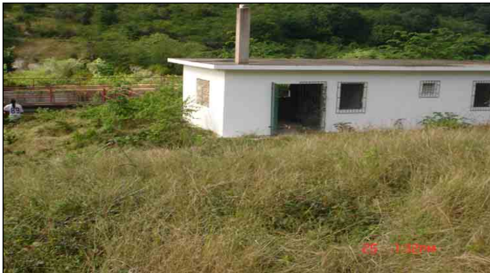
Plate 5.4.5.2 a: Existing sewage treatment plant that was never commissioned.

Existing sewage treatment facilities on the site include the use of a raw sewage pond, which receives sewage from the existing subdivision. A sewage treatment plant was built in the 90's and is still present on the site (Plate 5.4.5.2 a), but was never commissioned, as the 58 lots connected were under the capacity required to run the plant.